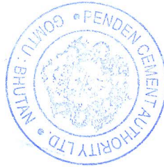
Director Business and Corporate Service Department